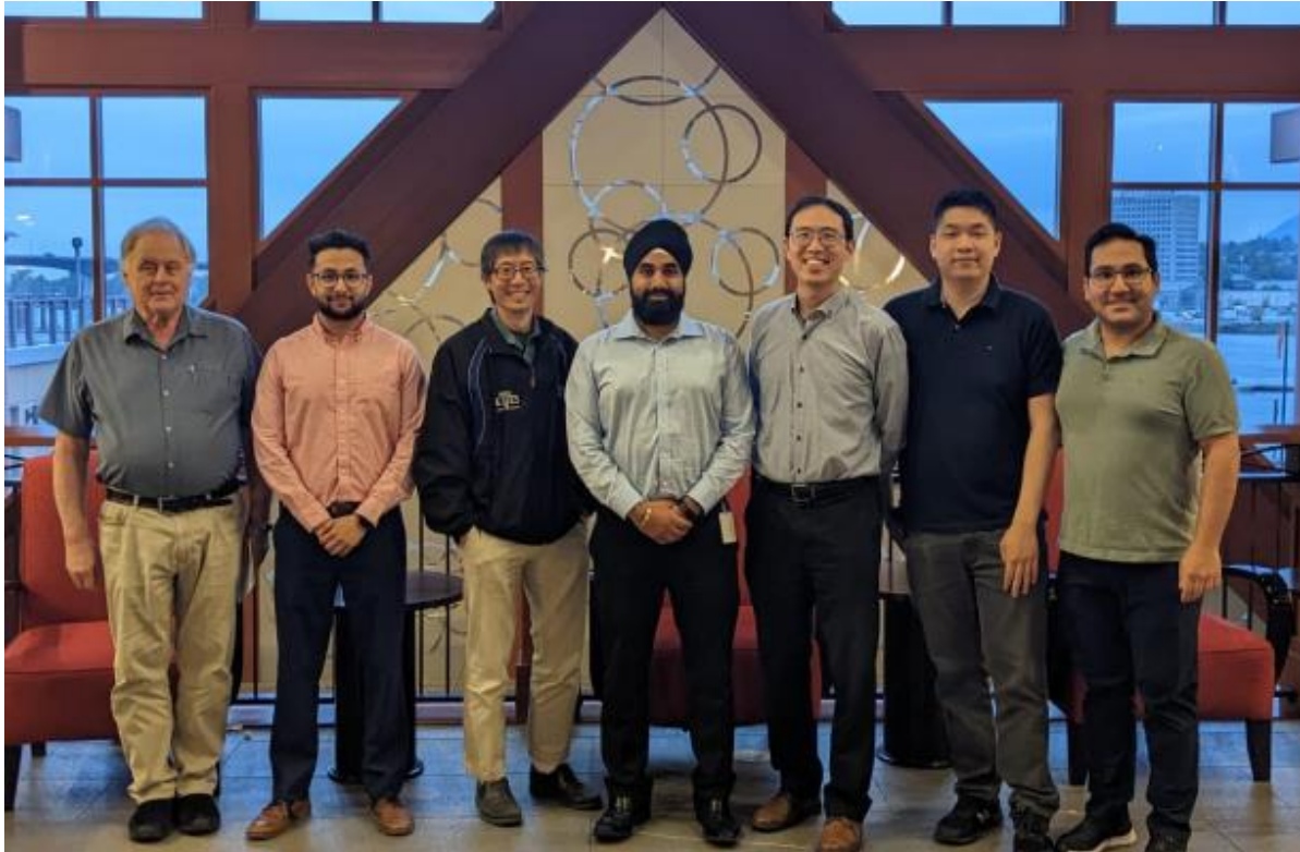
Richmond/Delta Branch volunteers at appreciation Dinner

was a resounding success. It not only celebrated the hard work and dedication of our volunteers and partners but also served as a platform to strengthen connections and inspire continued support for our organization's mission.